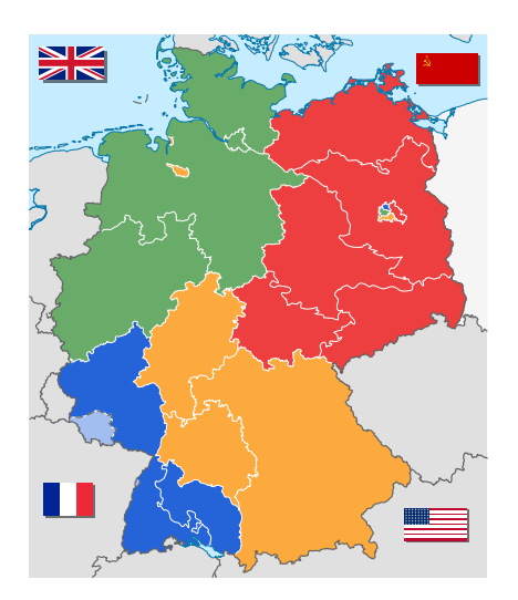
Figure 1: Division of Germany in occupation zones following World War II. The Sowjet occupation zone (red) became in 1949 the German Democratic Republic (GDR, East Germany). The other parts of Germany including the Western parts of Berlin formed the Federal Republic of Germany (FRG, West Germany). Nowadays, Germany consists of both parts.

After World War II, in 1945, the former German Reich was occupied by Allied forces who divided the country for administrative purposes into four occupation zones lead by the US, Great Britain, France and the Sowjet Union. The Sowjet occupation zone consisted of the Eastern parts, besides the city of Berlin that was divided between all four occupation powers, so that the Western zones of Berlin became an "island" within the Sowjet occupation zone. A larger part of the Sowjet occupation zone became Polish territory, some part territory of the Sowjet Union itself. The remainder formed in 1949 the "German Democratic Republic" (GDR, East Germany), while the parts of Germany occupied by the US, Great Britain and France formed the "Federal Republic of Germany" (FRG, West Germany), see Fig. 1.